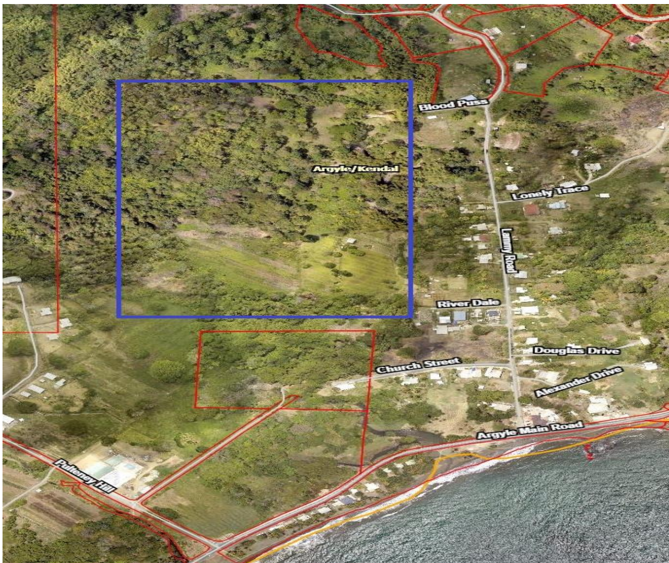
Figure 3: LAMMY ROAD AREA OF INTEREST (BLUE)